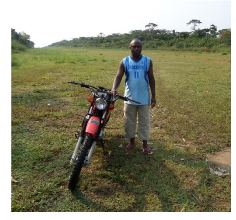
Figure 8 Monkoto airstrip