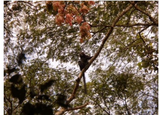
Figure 28 black-crested mangabey