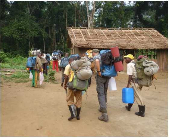
Figure 11 on our way to the Nguma camp site