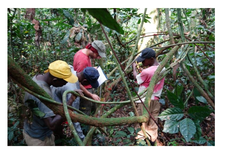
Figure 18 measuring lianas