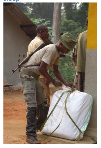
Figure 12 ICCN ecoguard at Lokofa