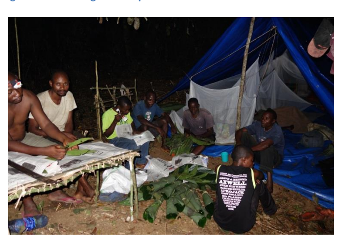
Figure 19 preparing herbarium specimens