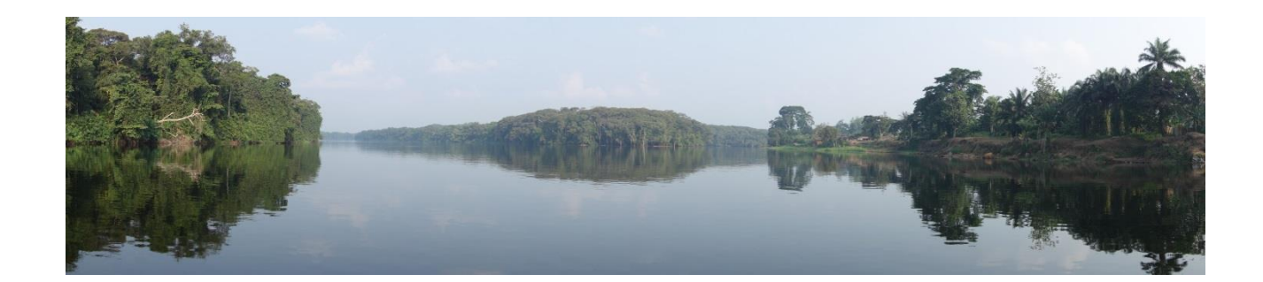
Figure 3 river view