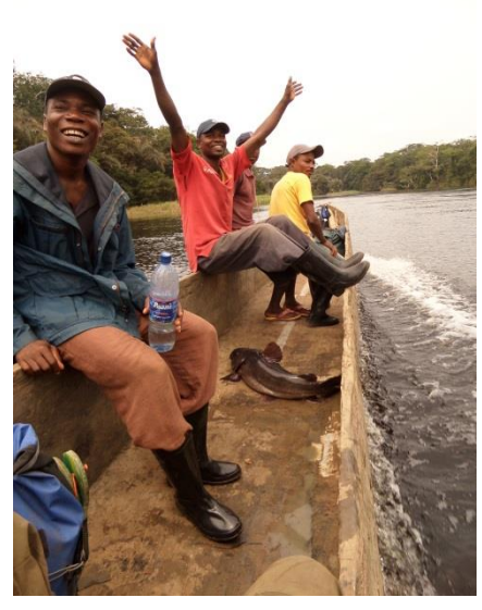
Figure 26 food: fresh fish