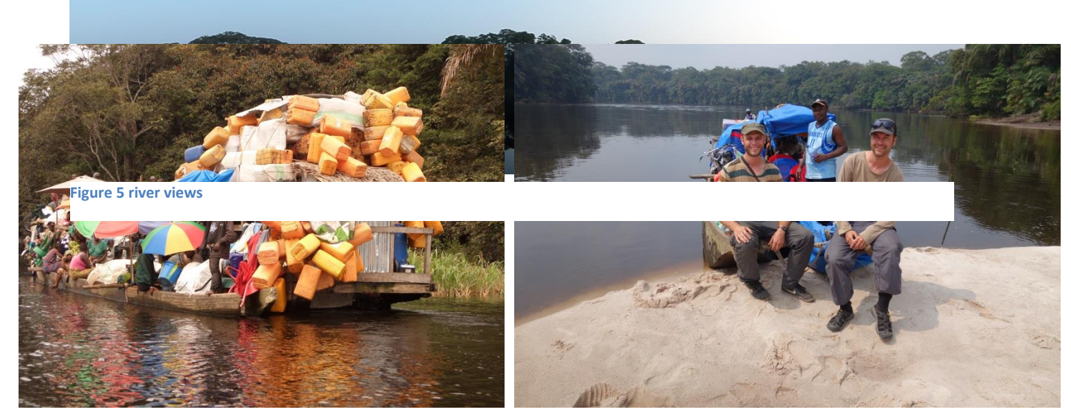
Figure 6 baleinière on its way from Mbandaka to Monkoto