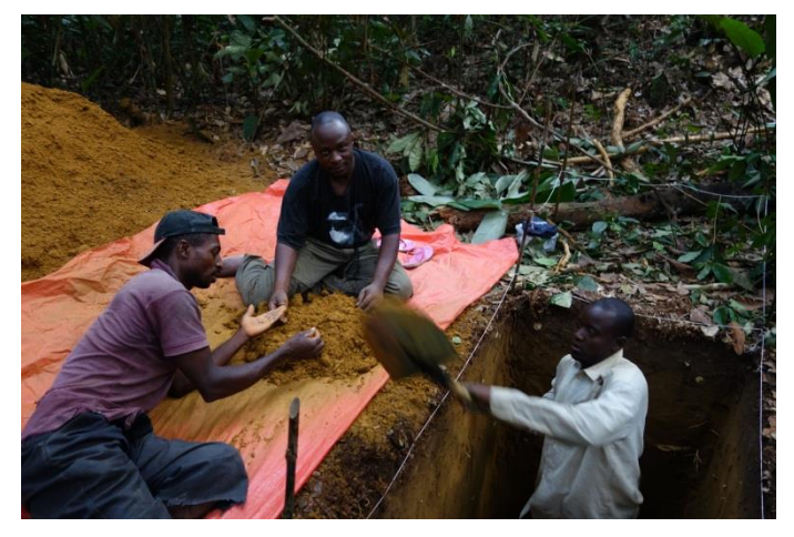
Figure 17 collecting soil charcoal