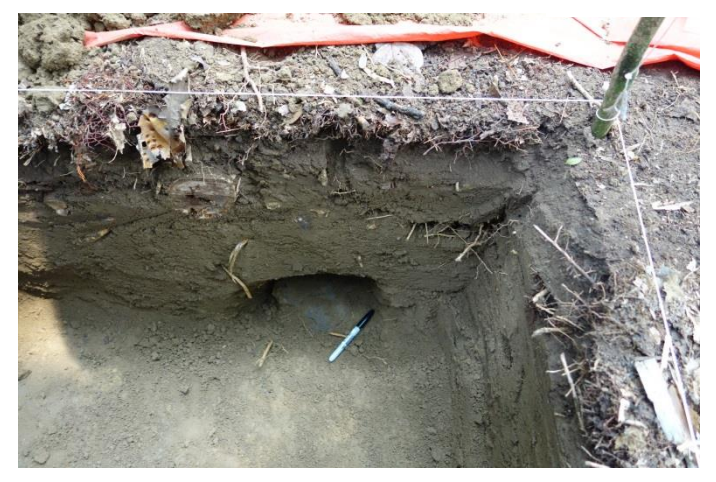
Figure 30 pottery shards in one of the pits