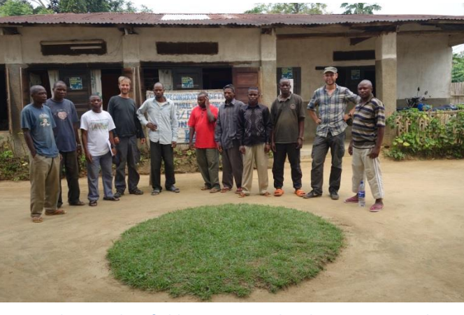
Figure 9 the complete field team at WCS headquarters in Monkoto