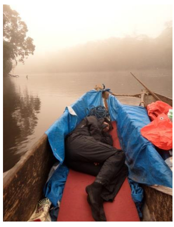
Figure 10 Simon catching some sleep