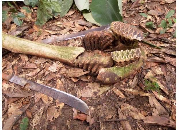
Figure 31 elephant remains on one of the plots