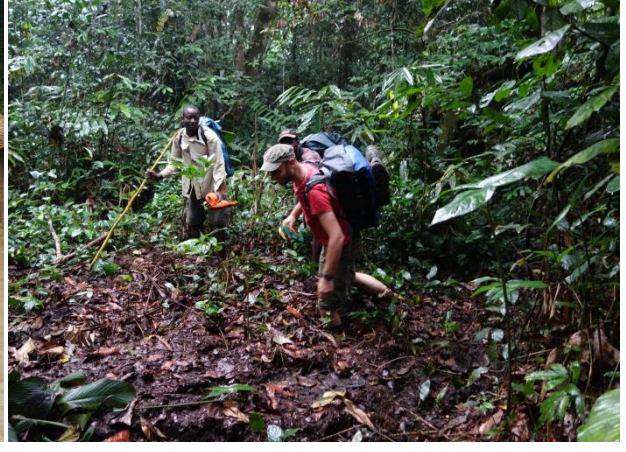
Figure 13 struggling through Nguma swamp