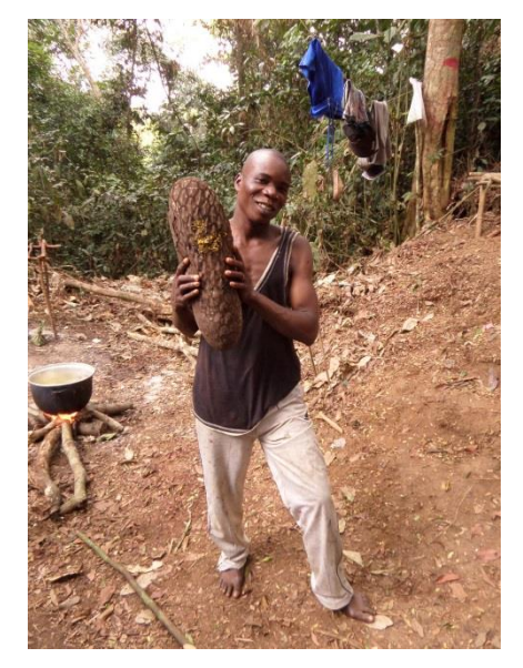
Figure 24 bonobo food: Annonidium mannii fruit, also delicious for us