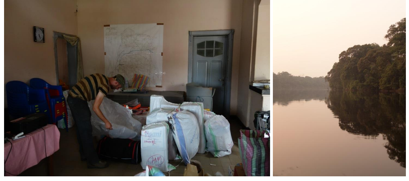
Figure 4 preparing the luggage in WCS headquarters in Mbandaka

Figure 2 localisation of Salonga NP in DRC (yellow dot=Nguma plots)