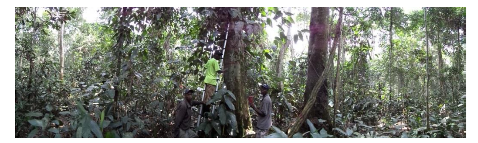
Figure 20 measuring a ladder tree